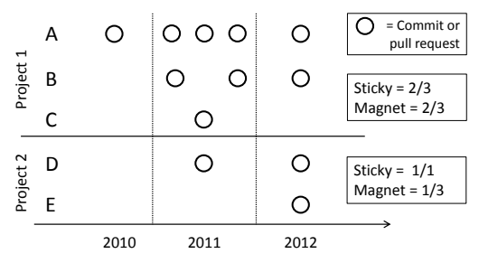
Figure 1: Example of Magnet or Sticky of values by our definition in 2011

However, the definition cannot be applied directly to open source projects, where a contributor can contribute to several projects at the same time. Therefore, we expand original definition to apply to open source projects as follows: