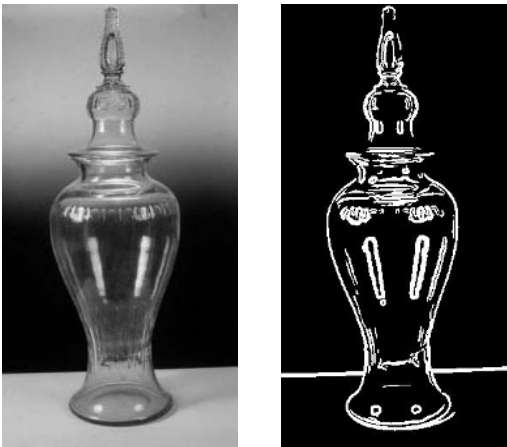
Fig. 3. Original and converted image of a glass bottle